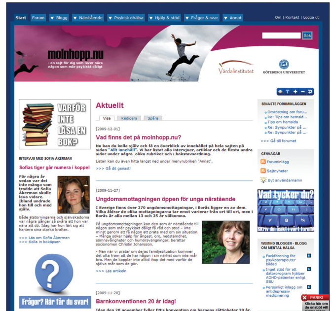
The website www.molnhopp.nu in December 3, 2009.